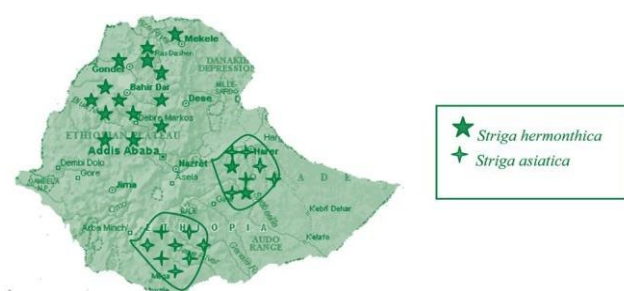
Figure 2. Distribution of two major striga species in Ethiopia

Striga hermonthica is the predominant species, according to Fasil and Parker. It is most severe in severely degraded areas of the country's north, northwestern, and east, including Tigray, Wollo, Gonder, Gojjem, North Shewa, and Eastern Hararghe (Figure 2). Given its widespread distribution, Ethiopian scientists believe that striga poses a greater threat to the nation than it does to the other SSA nations.